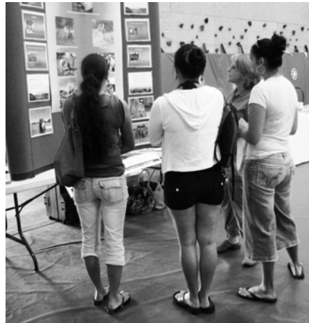
USDA-NRCS Exhibit Hana High School Career Day

The mission of the Hana SWCD is to provide a healthy natural resources environment for the people by coordinating technical, financial, and educational resources.